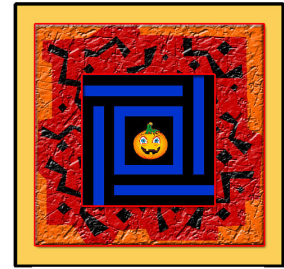
Family Fun Night in Lampasas